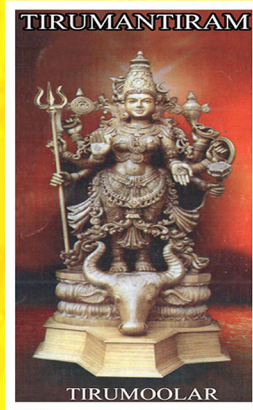
A Tamil classic Secrets of Sidha yoga and TantraZ Mantras 1656 &1657